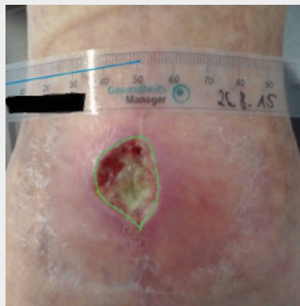
Figure 1: Wound at presentation